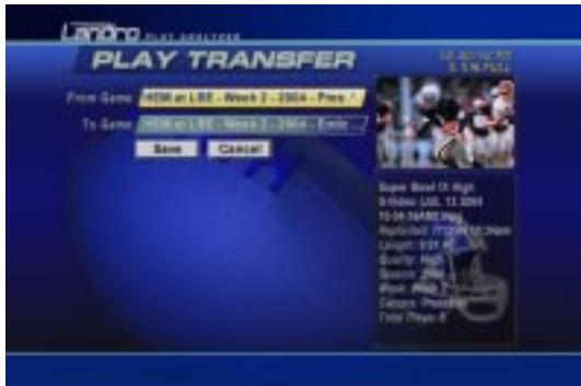
Play Transfer screen (from Step 4)