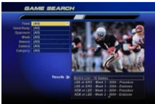
Game Search screen (from Step 5)